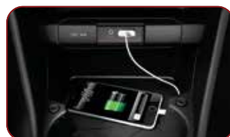
AUX and USB Ports