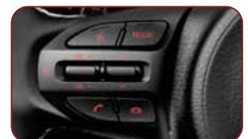
Audio Remote Control & Voice Recognition