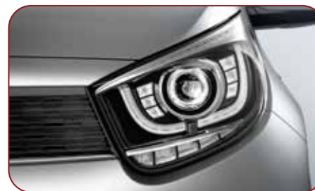
LED Projection Headlamps with DRL