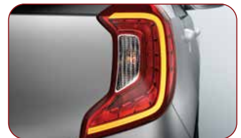
LED Rear Combination Lamps