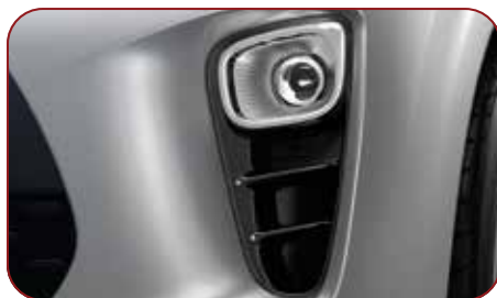
Projection Fog Lamps