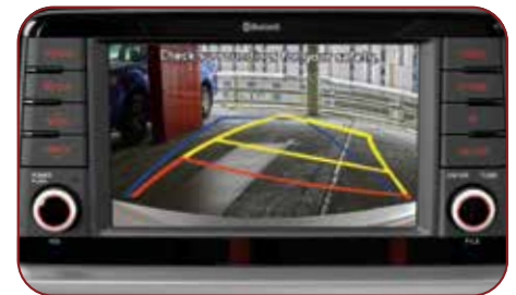
Dynamic Parking Guidelines