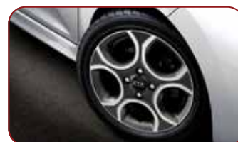
15" Alloy Wheel