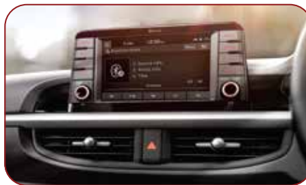
Floating 7" LCD Head Unit with Apple Car Play & Android Auto