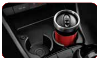
Front Cup Holder