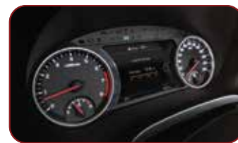
7-inch TFT LCD Supervision Cluster*