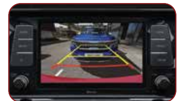
Rear View Monitor*