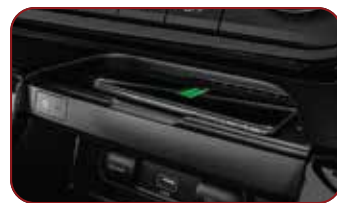
Smartphone Wireless Charger