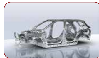
Advanced High Strength Steel & Press Hot Stamping