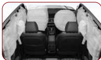
6 Airbag System