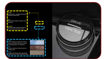
Drive Traction Selector