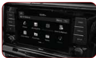
8-inch Display Audio*